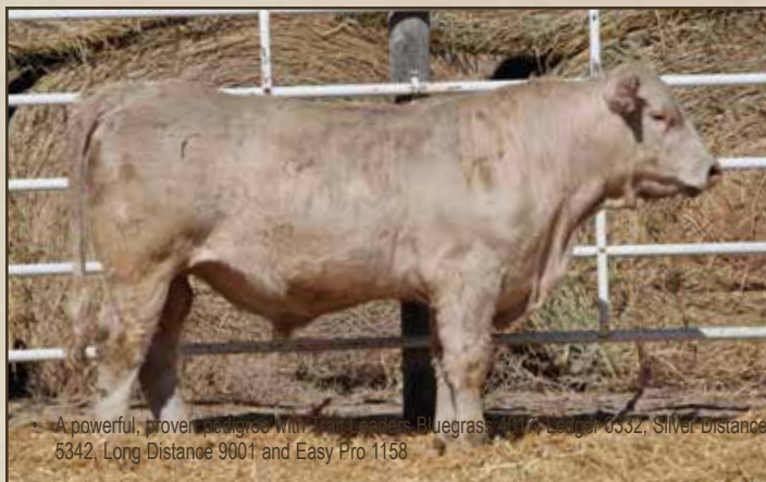
A powerful, proven pedigree with sires Bluegrass 4017, Leader 0332, Silver Distance 5342, Long Distance 9001 and Easy Pro 1158