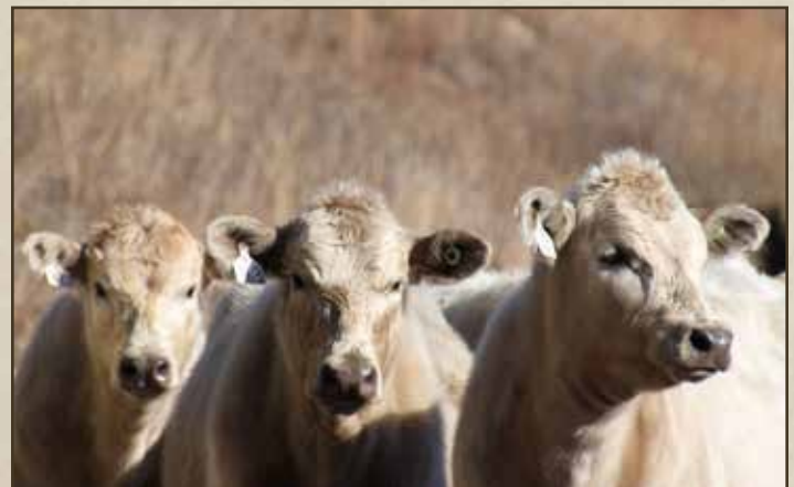
Crossbred Calves for optimal terminal cross breeding value from the ranch through the feeder