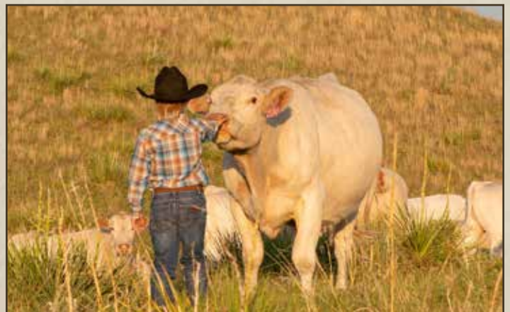
Waylon and HC Ms Blue Rock 5114