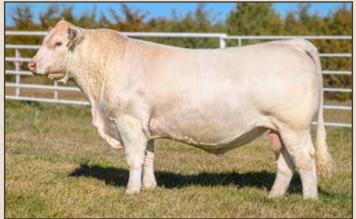
LT Judge 0691 Pld

Calving ease, low birth weight, growth, and carcass performance are all words that can be used to describe LT Judge 0691 PLD. Judge is proving that as a herd sire he can provide that calving ease and low birth weight and compliment it with his ability to produce calves that grow exceptionally well. Ranking in the top 10% for the breed, Judge's EPDs speak for themselves. We are excited about this first crop of Judge bulls and believe Judge will be making a name for himself in the future. Semen available.