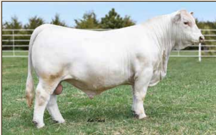
NGC Loyalist 839F ET