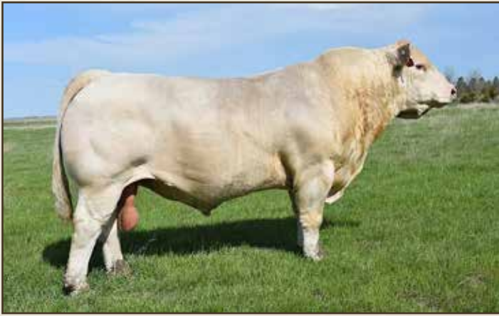
LT Patriot 4004 Pld