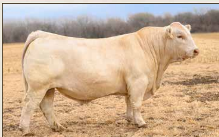
CCC Probit 9506 P